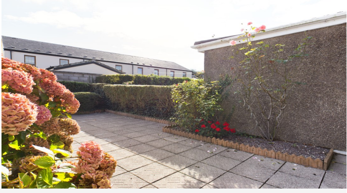
Messrs. Cohalan Downing, for themselves and for the vendors of this property whose agents they are, give notice that: (i) the particulars are produced in good faith, are set out as a general guide only and do not constitute any part of a contract, (ii) no person in the employment of Messrs. Cohalan Downing has authority to make or give any representation or warranty whatever in relation to the property.