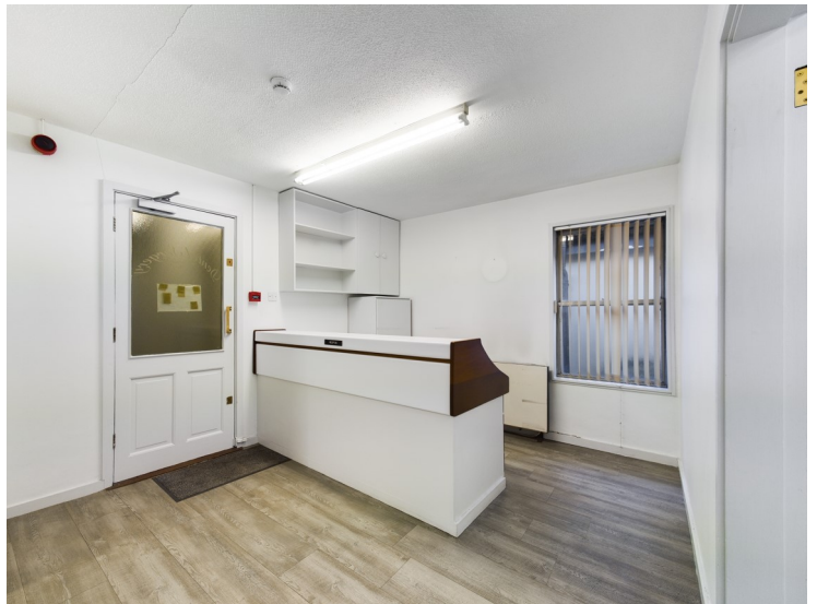
FOR IDENTIFICATION PURPOSES ONLY