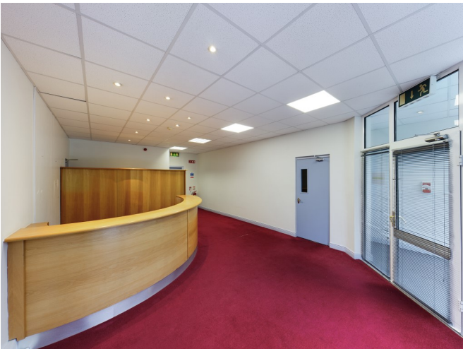
For Identification Purposes Only