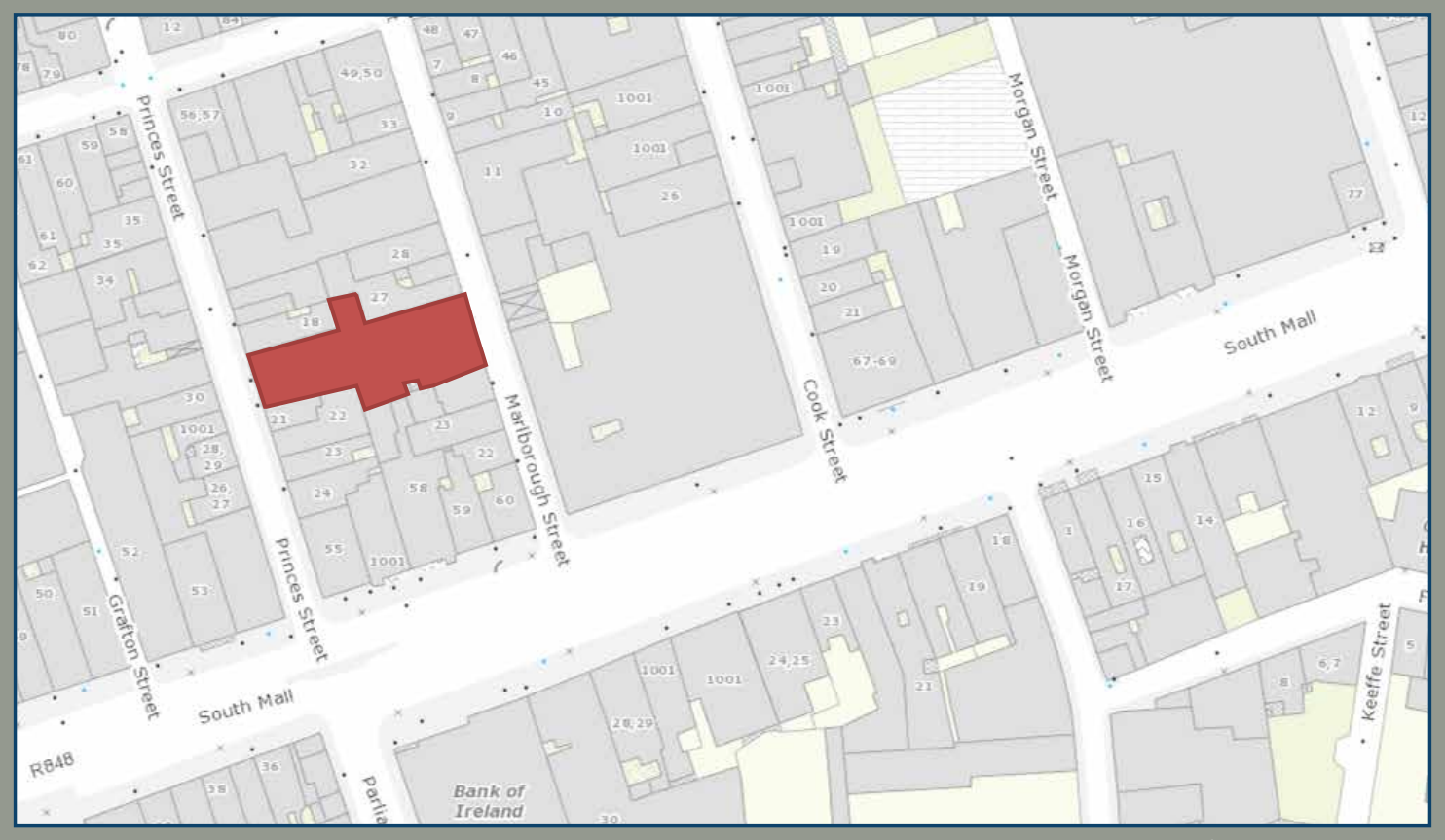
For Identification Purposes Only